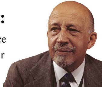
W. E. B. Du Bois, Chairman of the PIC

Center (PIC) which was the American affiliate of the World Peace Council (WPC) founded in 1948 in Poland.