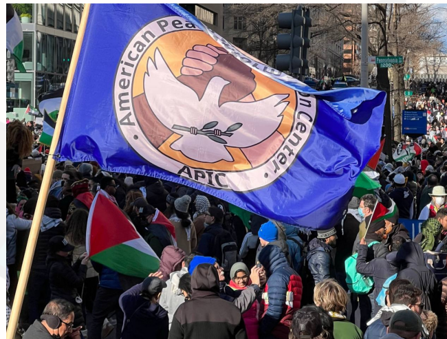
APIC supports liberation of Palestine